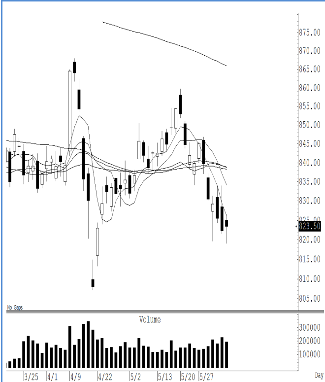
S50M24 (Close 823.50 Chg 1.20)